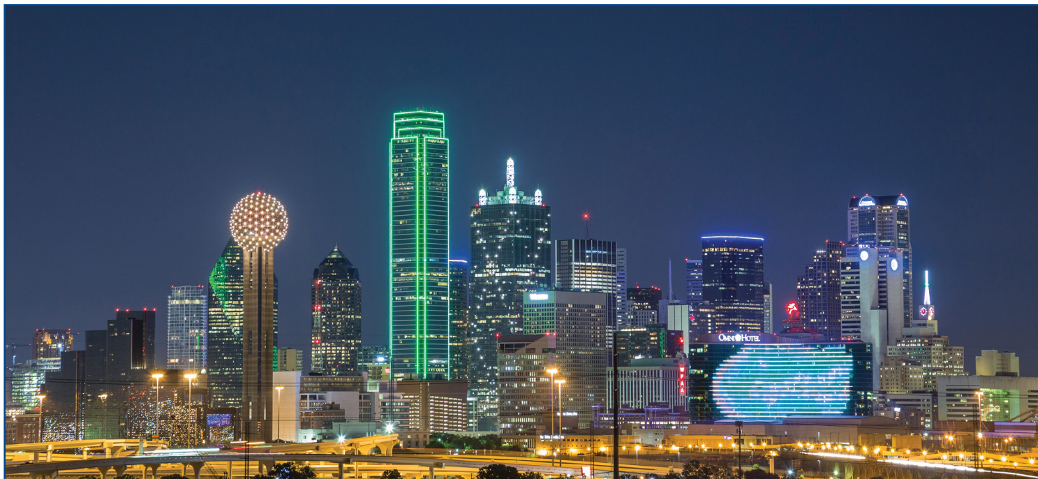
Downtown Dallas welcoming the Gators