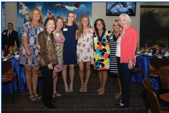
2017 Endowment Dinner

On Thursday, April 6, 2017, Gator Boosters held our 4th Annual Athletic Scholarship Endowment Dinner. This amazing dinner is held to honor and thank our scholarship donors for funding endowments. Donors have the opportunity to meet student-athletes and get to know how their lives are enriched by their experience at UF in athletics and in the classroom.