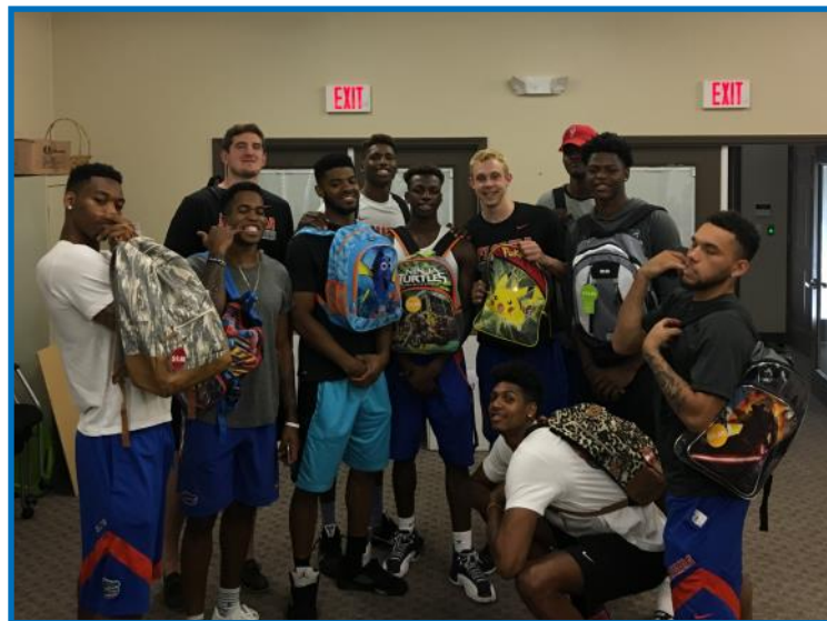
Men's Basketball fills backpacks at Peaceful Paths for local students in the area

Being a Gator is more than being a great student or a fantastic athlete, it means being an exceptional human being. Being a Gator is being kind and helping your neighbor. Although these are only a few outstanding deeds carried out by our very own Gators, they serve as examples of what it truly means to be “Gator Good”.